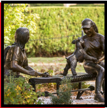
Pete's Pet Posse Statue (OSU Celebration Garden)